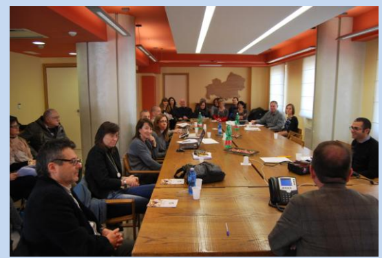
The Start up Dissemination Workshop