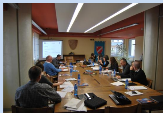
The Consortium Meeting