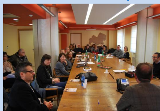
The Start up Dissemination Workshop